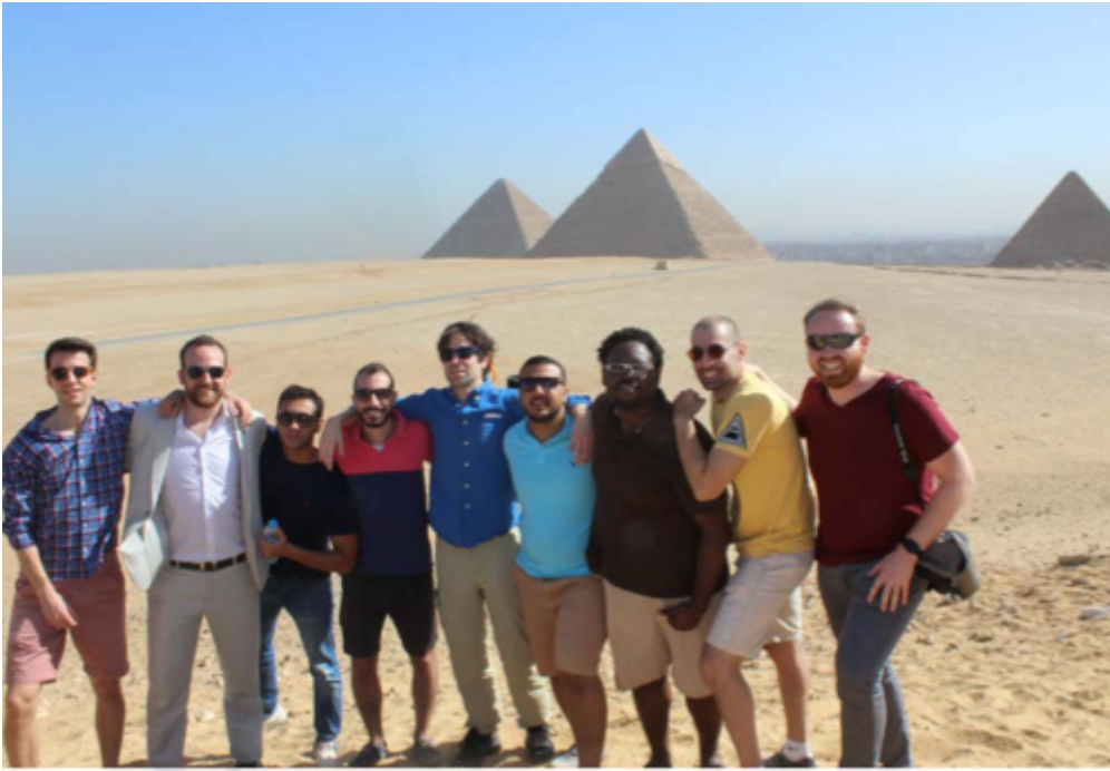
2015 GABR FELLOWS AT THE GIZA PYRAMIDS