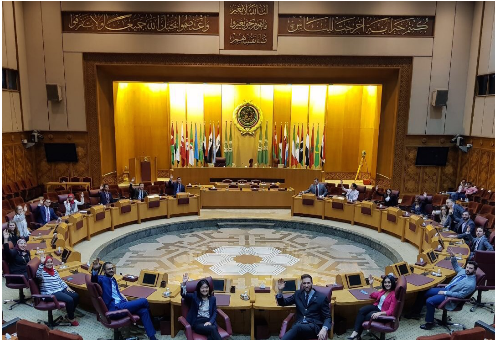
2017 FELLOWS AT THE ARAB LEAGUE