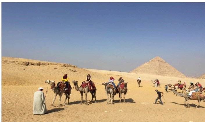
2017 Gabr Fellows at the Giza Pyramids

After the intense but rewarding Egypt program, the 2017 Gabr Fellows are actively preparing for the US portion of the Fellowship, which shall take place 21 st – 28 th October in New York, New Jersey and Washington, DC.