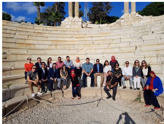
2017 Fellows with Mr. Hussein Fahmy (left) and at the Roman Theatre in Alexandria (right).