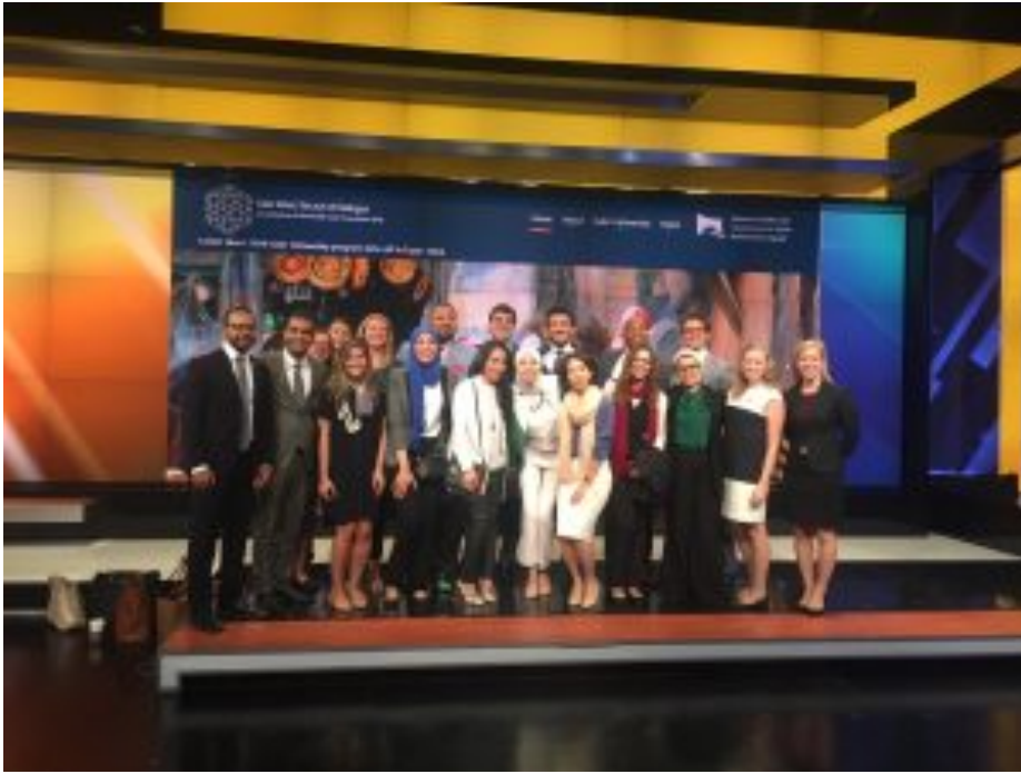
2018 GABR FELLOWS AT CNBC STUDIOS

With the start of 2019 comes new beginnings and possibilities for the Shafik Gabr Foundation. After a successful 2018, marked by the implementation of the annual Gabr Fellowship program and engagement with key stakeholders in a variety of sectors, the Foundation is poised for continued success in the coming year. At a time of growth in new technologies and the reshaping of the status quo in business, the Foundation aims to empower and inspire the next generation.