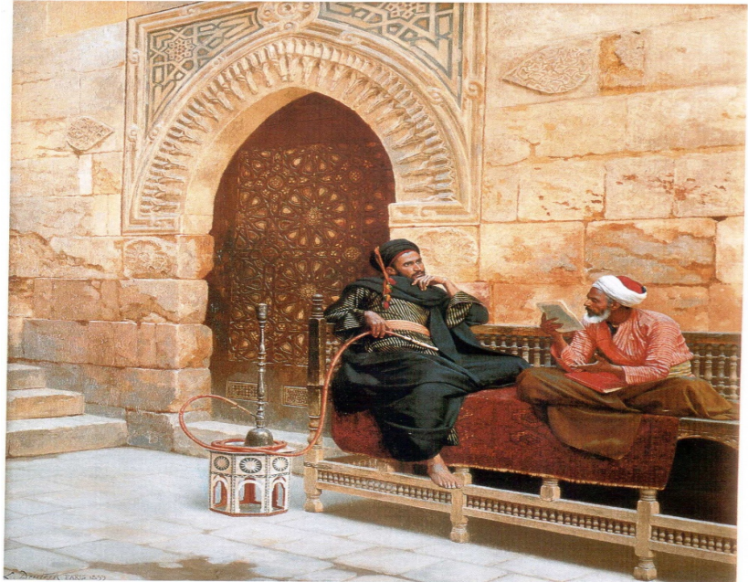
Reading the Letter , Ludwig Deutsch

For earlier itineraries of the US program, please see the previous years' reports at https://eastwestdialogue.org/fellowship/brochures/