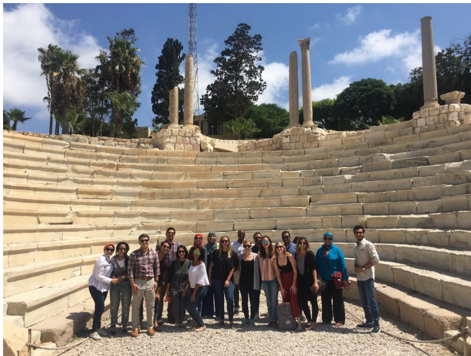
2018 GABR FELLOWS AT THE ROMAN AMPITHEATRE IN ALEXANDRIA

Despite being a month into the new year, 2019 has already proved to be eventful. With a shutdown of the US government, a denunciation of the Brexit deal, and a turbulent global stock market, there are many disruptions expected in the months ahead. Ordinary citizens' faith has been tested and there seems to be a diminishing trust in institutions and traditional power structures. If people don't believe that their needs can be met through these avenues, then what fills that void?