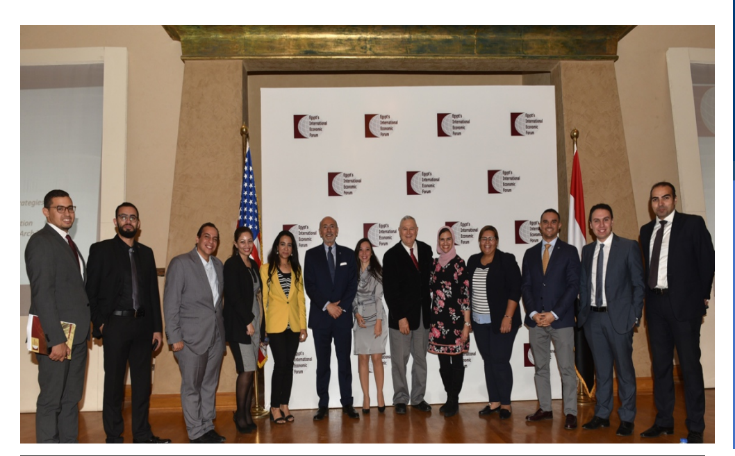
GABR FELLOWS WITH REP. DANA ROHRABACHER AT THE ROUNDTABLE DISCUSSION 'US-EGYPT BILATERAL RELATIONS' HELD AT ARTOC HQ IN CAIRO ON DECEMBER 10, 2019