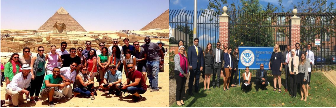
Gabr Fellows in Giza, Egypt and Washington, D.C.

The East-West: The Art of Dialogue will begin accepting applications for its 2020 Gabr Fellowship program in January.