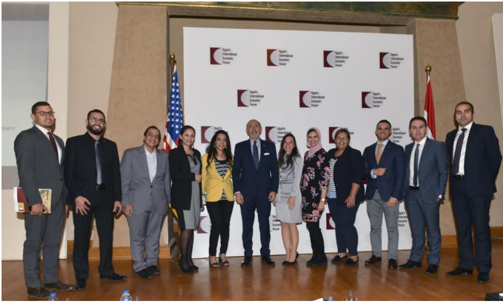
CHAIRMAN SHAFIK GABR MEETS WITH GABR FELLOWS AT ARTOC HEADQUARTERS IN CAIRO IN 2019