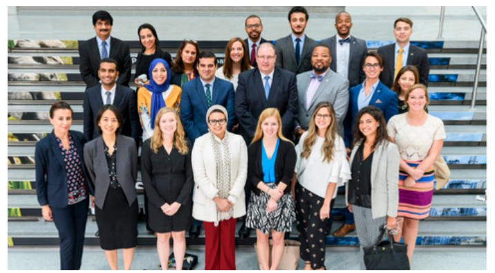
2018 Gabr Fellows visit the World Bank, Washington DC

The mission of the Fellowship is to promote greater mutual understanding by building bridges between the two cultures by instigating dialogue and the exchange of ideas between emerging leaders from the United States and Egypt. Together, they explore one another's cultures, political realities, business trends and their goals for the future.