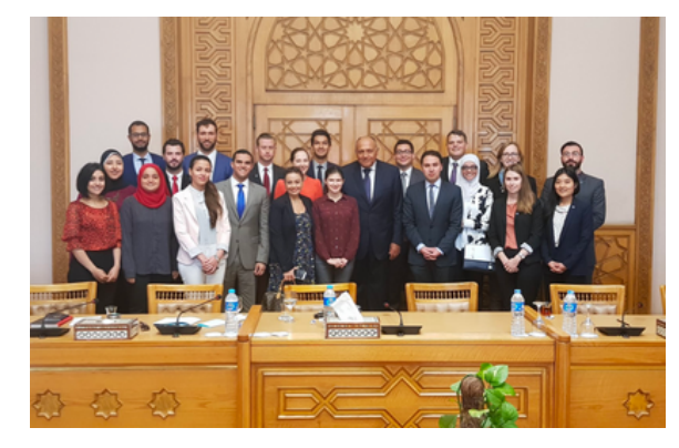
Gabr Fellows with Egypt's Minister of Foreign Affairs, Minister Sameh Shoukry

Together, they are creating the legacy of 'The Gabr Fellowship': an international cohort dedicated to pursuing cooperative, collective solutions to their regions' most pressing issues.