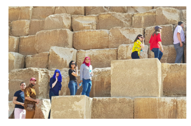
Gabr Fellows take on the Pyramids